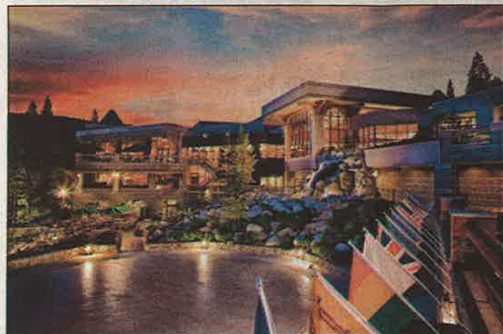
Resort at Squaw Creek

SANTA MONICA'S remodeled Palihouse is just blocks from the ocean and features rooms as well as residences.