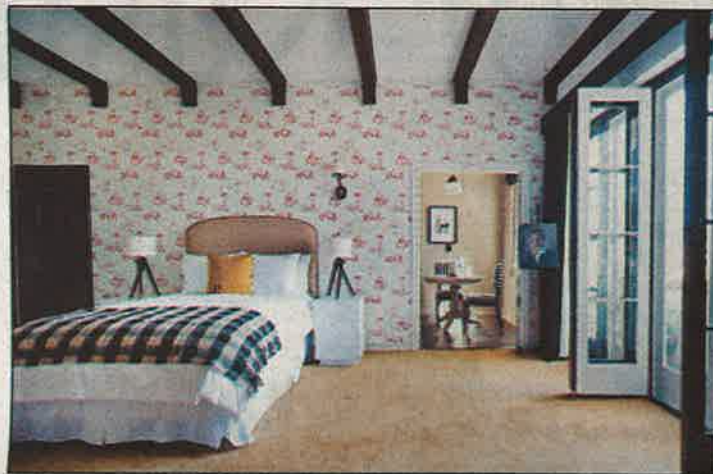
Palihouse Santa Monica

This is a long way to go for a Mother's Day treat, but it's worth the trek. This sleek new hotel has views of the Sydney Opera House and the Harbor Bridge, both iconic global structures. Start with a eucalyptus martini, followed by dinner in the Park Hyatt Dining Room, a showcase for a global fusion of flavors, fresh produce and well-traveled kitchen talent. Afterward, roam the hotel's notable modern Australian art and photography collec-