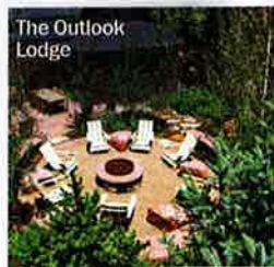
The Outlook Lodge

and a large wraparound porch. (From $99; outlookgmf.com )