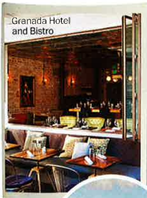
Granada Hotel and Bistro