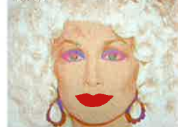
Dolly Parton by Andy Warhol, 1985.

CHEAP THRILL: Visit Crystal Bridges Museum (free admission; crystalbridges.org ). Located just a quarter of a mile from the hotel, the two-year-old art museum founded by Walmart heiress Alice Walton includes five centuries of American art, ranging from the Colonial era to current day—think iconic artworks such as Asher B. Durand's Kindred Spirits , Norman Rockwell's depiction of Rosie the Riveter, and Andy Warhol's Dolly Parton . Plus, the grounds have 3.5 miles of walking trails to enjoy.