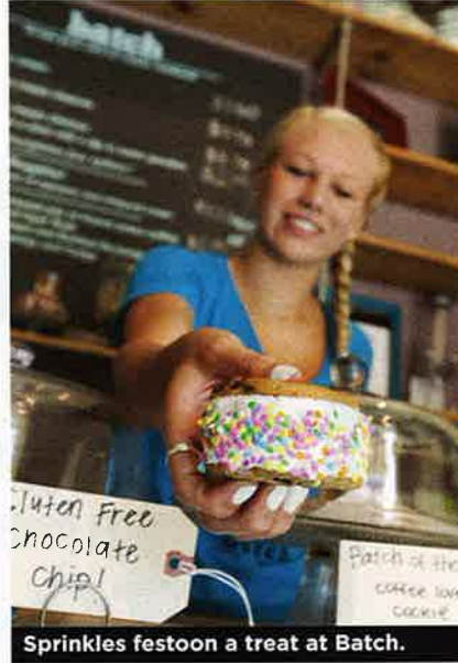
Sprinkles festoon a treat at Batch.

5 Firestone Grill’s vast courtyard and cavernous interior are filled nonstop with satisfied diners, and no wonder: Enjoy succulent tri-tip on a French roll dipped in garlic butter and you may need to head back to the Granada Hotel for a nap. firestonegrill.com . —KAREN ZUERCHER